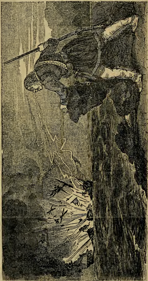
CROCKETT BLOWING UP A MAN OF WAR, BY A FLASH OF LIGHTNING FROM HIS EYE.